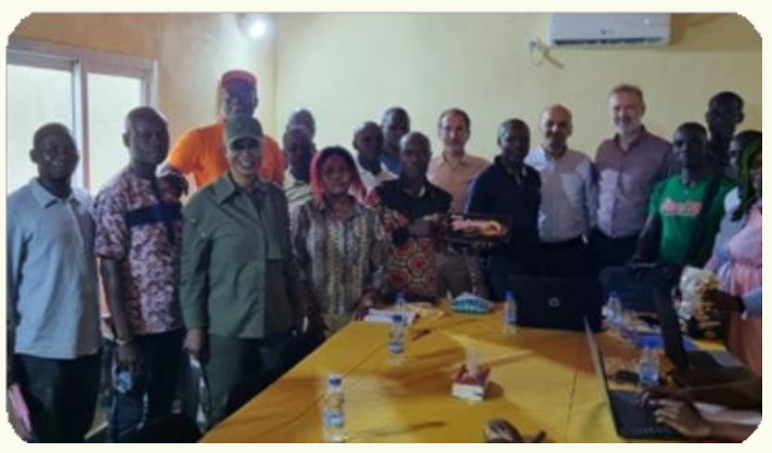
Önem's school renovation Project in a selected section of the cooperative: BILAHIO which is a sub-prefecture of GUIBEROUA.